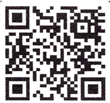
Online Registration Form QR Code