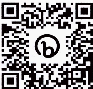
QR Code - Pilot Testing Website