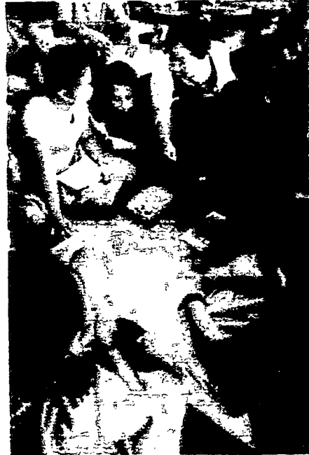
Teaching how to count numbers in Korean