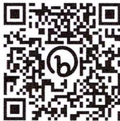
Online Pre-registration Form QR Code