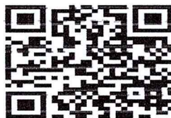
QAME QR Code