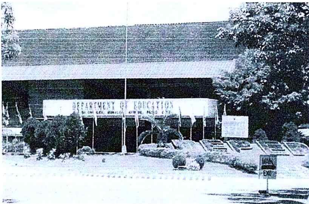
The Department of Education (DepEd) is planning to include scouting in the basic education curriculum. The department is currently in the process of reviewing the curriculum and will be conducting consultations with stakeholders. The department is also planning to conduct a pilot program in selected schools.